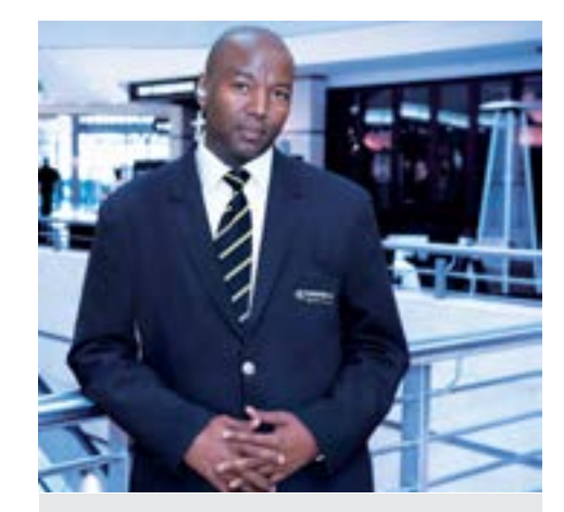
We are industrious, efficient and dependable.