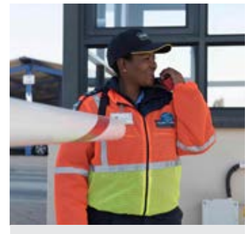
We embrace highly ethical, moral and respectful behaviour, without exception.

Our values underpin who we are and serve to direct our thinking, our decision-making and the way we conduct our business as 'ONE TSEBO'. The four Tsebo values support our vision, shape our culture, and reflect what we value: