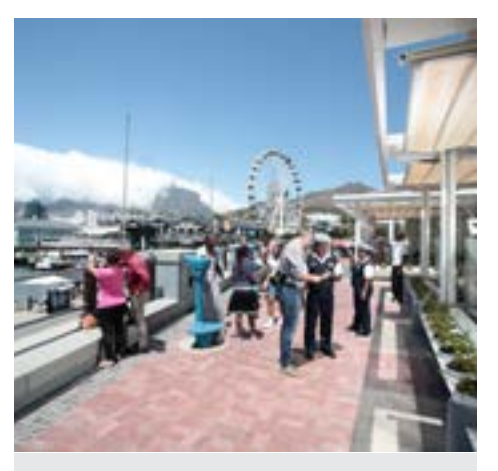
We care for people, communities and the environment.