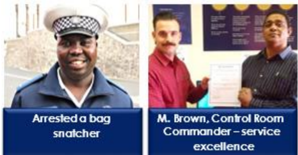
Arrested a bag snatcher

Individual awards and commendations for the V&A are a regular occurrence, as the Thorburn team deliver service excellence: